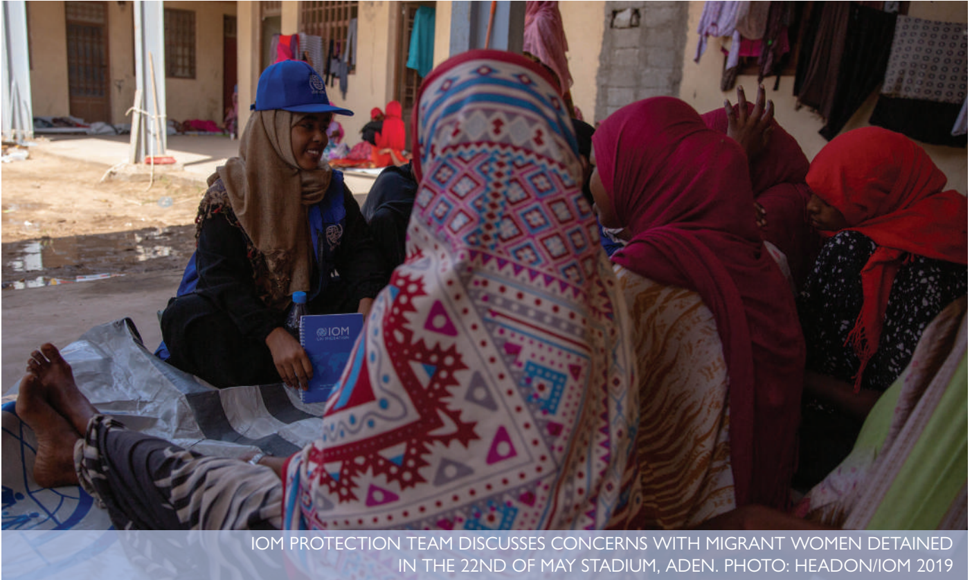
IOM PROTECTION TEAM DISCUSSES CONCERNS WITH MIGRANT WOMEN DETAINED IN THE 22ND OF MAY STADIUM, ADEN.