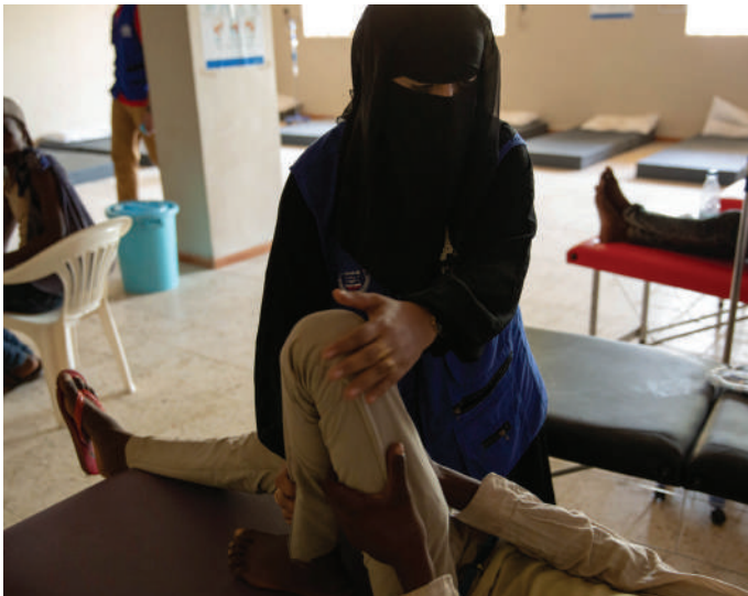
IOM'S HEALTH TEAM ASSESSES A MIGRANT WITH AN INJURED LEG AT 22ND OF MAY STADIUM.