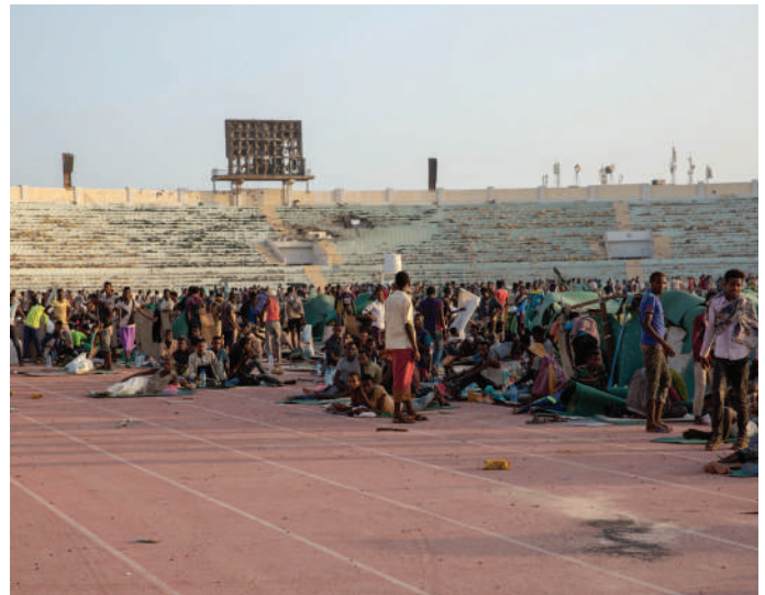
MIGRANTS SET UP CAMP FOR THE NIGHT OUTDOORS AT 22ND MAY STADIUM.