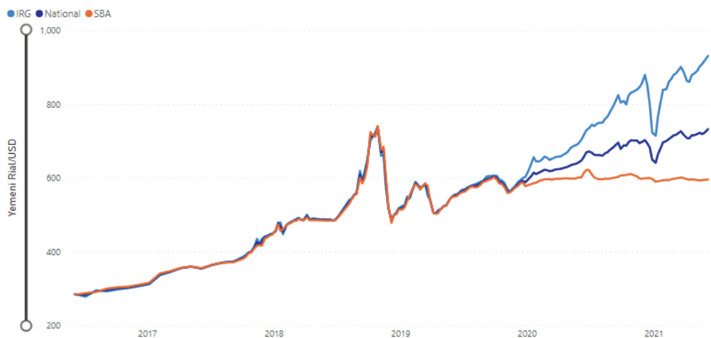
The Yemeni Rial has hit a new low reaching YER930 against the US dollar in southern governorates

In the area of food security, participants noted the critical need to enhance nexus coordination between humanitarian and development actors, both in terms of delivery on the ground and programming, and to enhance cross-sectoral integration to address immediate needs. A concerted, multi-sectoral package of recovery and development investments, building Yemen's resilience to shocks in the medium to long term, is urgently required. More information on SOM III outcomes can be found here: https://ec.europa.eu/echo/sites/default/files/20210601_som_iii_co-chairs_summary_final.pdf